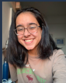
Stage Manager of A Waiting Room