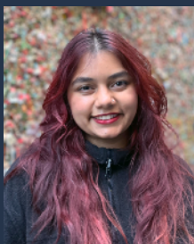
Ronny in A Waiting Room