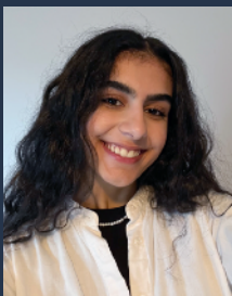
Dramaturg of The Coolest Ghost