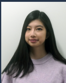
Stage Manager of The Coolest Ghost