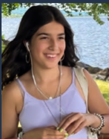
Mindy in A Waiting Room